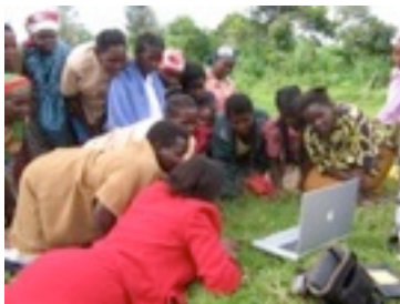
Community Action Project viewing and approving Empower's fundraising materials.

Through the dedication of our committed volunteers, a small idea to help a handful of children in one Ugandan village has grown into a sustainable community development partnership in two counties in Uganda. I am very proud of where we are today because I can see the incredible impact of the services we are able to provide.